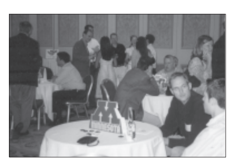
U of Minnesota reunion in Las Vegas

The Class of 2006 is very diverse in its practice plans. Dr.