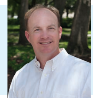
I'm excited to see everyone and reconnect with colleagues from all three constituencies!