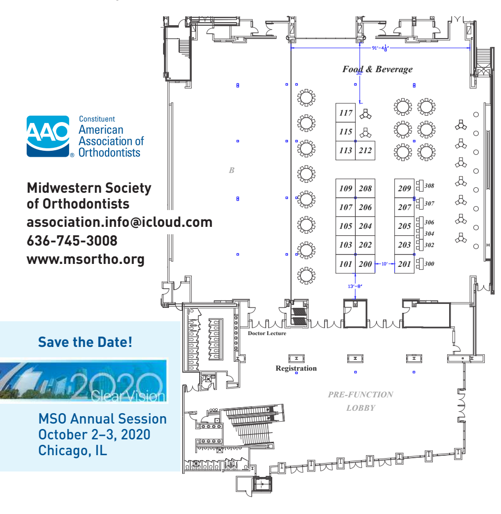
Exhibit Hall | Hilton Branson Convention Center