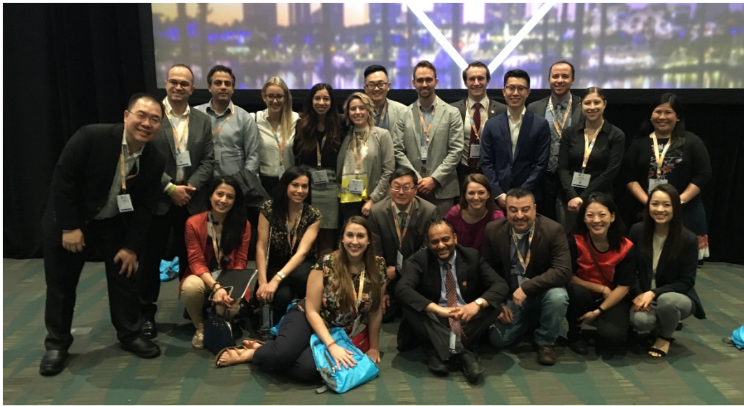
UIC Orthodontic faculty and residents at the AAO Meeting in Los Angeles

We have had a productive year doing high quality research. In the past academic year, our faculty members and residents published 31 articles in peer-reviewed journals and two book chapters. Several of our faculty members and residents presented at national meetings such as the AAO and AADR/IADR. We also obtained four grants to further research. Below are the details.